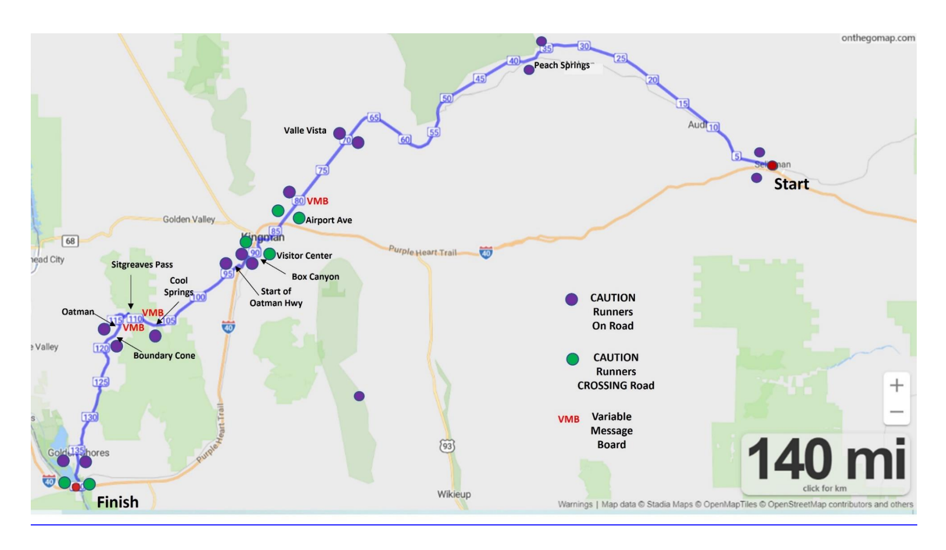
Figure 2 Course Map Signage Locations